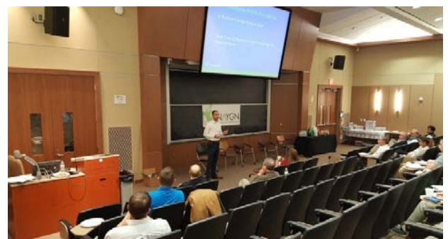
AREVA and Westinghouse Nuclear Advocacy Event at UNC Charlotte