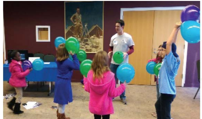
Southern Nuclear Corporate Chapter's Scout Merit Badge Workshop