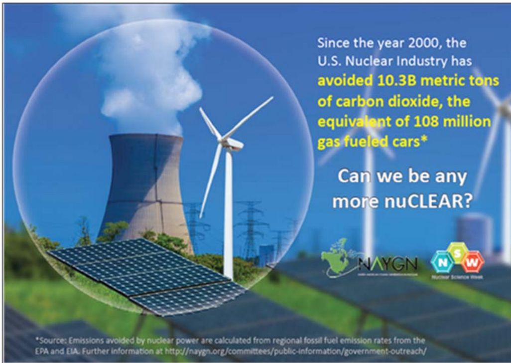
2016 NAYGN Post Card