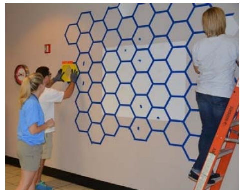
The River Bend chapter safety spotlight mural in the employee cafeteria.