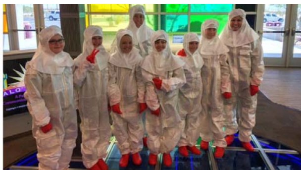
Girl Scout Event at Palo Verde Energy Education Center