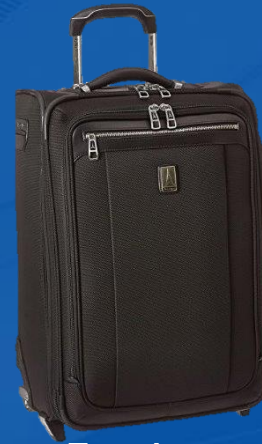
Travelpro Platinum Magna Carry On