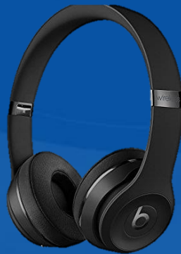
Beats Solo3 Wireless On-Ear Headphones