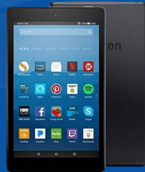
Amazon Fire HD 8 Tablet