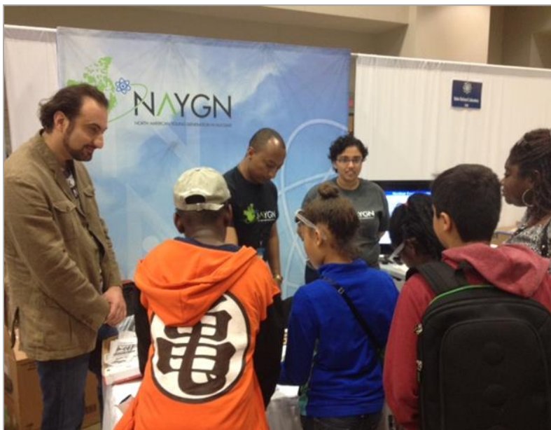
AREVA TN, NEI, and MPR Associates Chapters Support the 2014 USASEF

The Atlantic Region rolled into 2014 with a focus on leveraging inter-chapter participation in community outreach events. This was best exemplified in NAYGN's participation in the 3rd USA Science and Engineering Festival (USASEF) held in Washington, DC in April, 2014. NAYGN sponsored an exhibit booth that focused on educating youngsters (and their parents) on the efficiencies and safety aspects the nuclear industry. Volunteers from all over the Atlantic attended to man the booth. Looking forward in 2015, the Atlantic region is maintaining focus on outreach and doing more on the inter-chapter level.