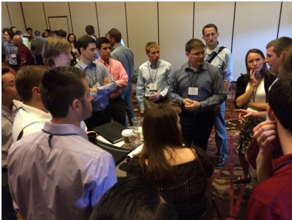
NAYGN members participate in 2014 Innovation Competition