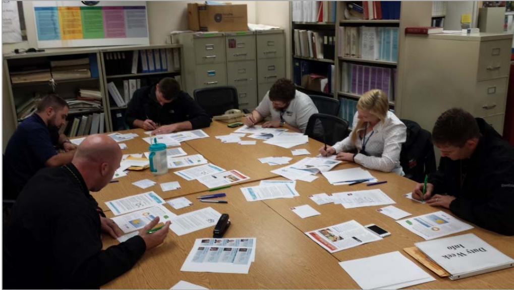
NAYGN Members participate during Post Card Push Day