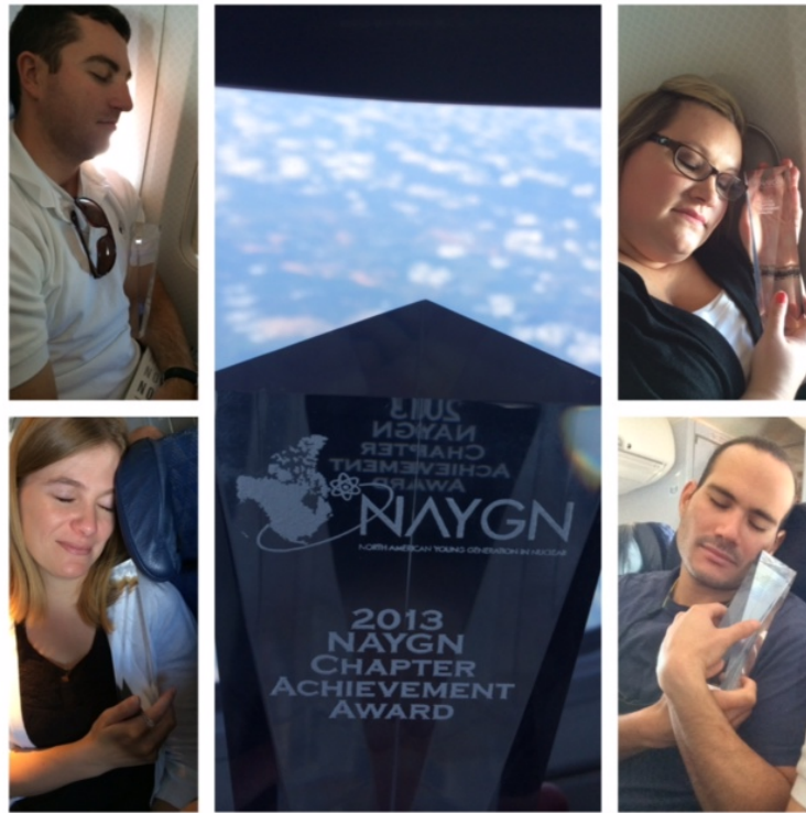
River Bend Brings the 2013 Chapter Achievement Award Home from the 2014 Conference