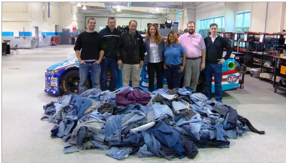
VC Summer NAYGN Chapter Hosts Blue Jeans Go Green™ Denim Recycling Program with Participation from Westinghouse, CB&I and SCANA headquarters