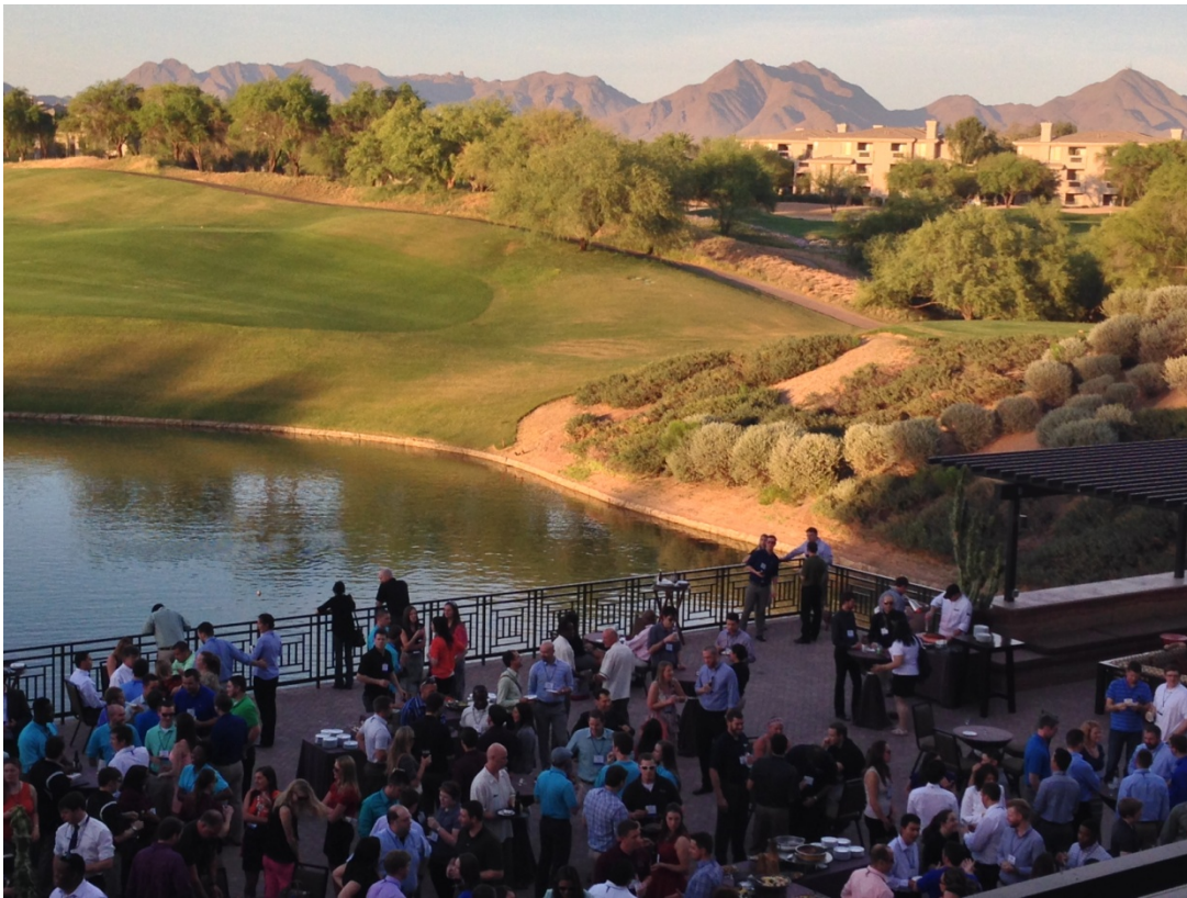
NAYGN members network in Scottsdale, AZ

In addition to the networking opportunities offered at the professional development conference in May, 2014, several events were held on the Regional Level to encourage members to network. Many regional-level events were planned and executed, in addition to the numerous networking opportunities that local chapters offer to their own members. In addition to all of these events, NAYGN continues to develop an online networking presence through various social media sites. With NAYGN's online presence and activities in all of the seven NAYGN regions, NAYGN members have many opportunities to network.