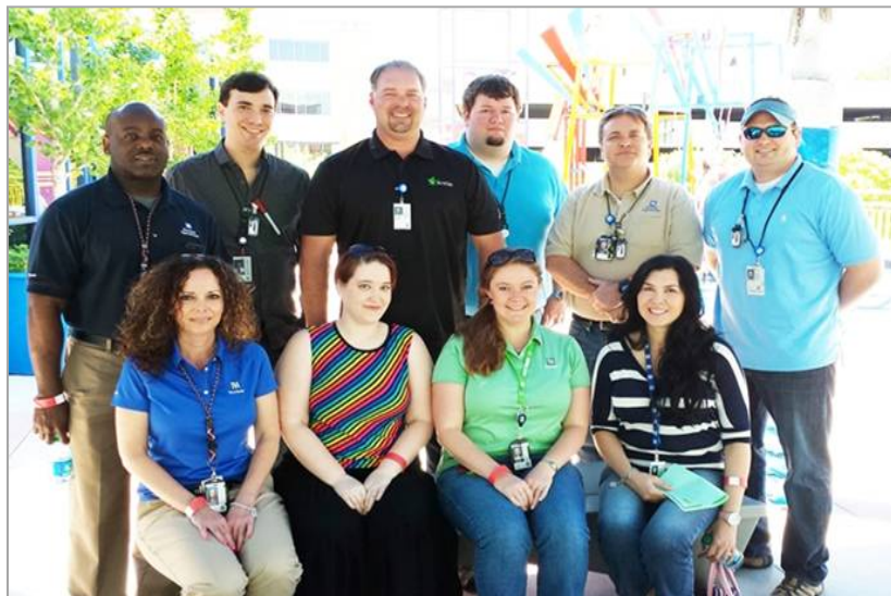
NAYGN members During Energy Day at Chattanooga's Creative Discovery Museum

unique event has raised River Bend's footprint in public outreach in their local community, garnering over 70 participants ranging from elementary to high school students.