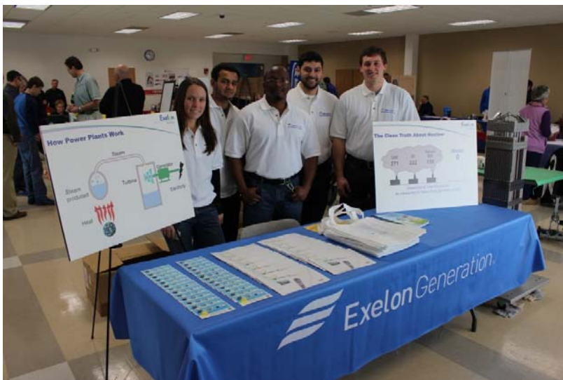
Exelon NAYGN Members Promote STEM and Nuclear Power

Regional Conference was held December 12, 2014 was held at the Kalahari Resorts in Sandusky, OH. There were 35 attendees from the Midwest chapters as well as 6 non-member attendees and 8 speakers. The conference's theme was Focus on Outreach. Speakers were from local government entities, FirstEnergy and DTE, and The Ohio State University. The closing session speaker was a retired nuclear industry executive. The conference focused on community outreach, public information, STEM education and the current state of the industry. There was also a pre-conference social and networking event that included an ugly Christmas sweater contest.